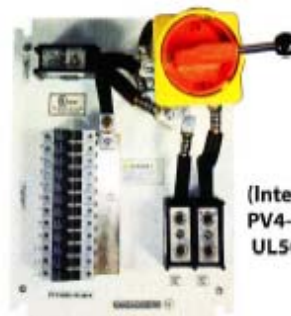
(Internal Photo) PV4-12C-12A UL508